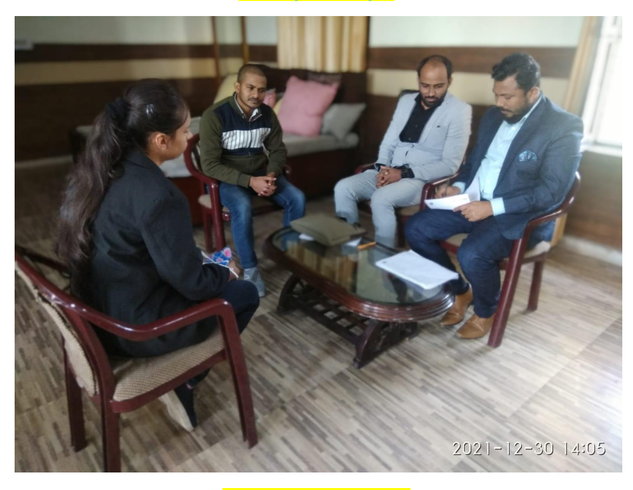
Experts Conducting Interview