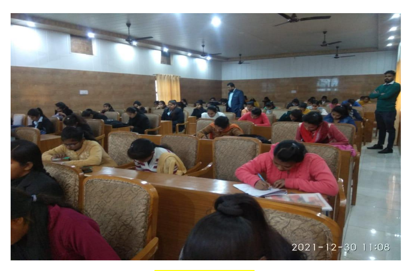
Screening Test Going on