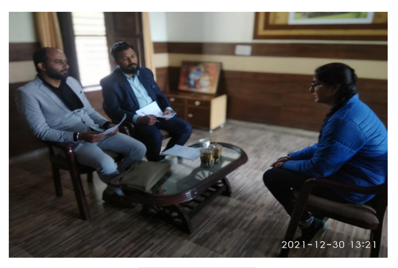
Experts Conducting Interview